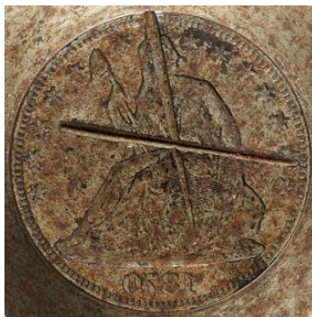
Canceled 1870 Half Dollar Obverse Die

Cancel. To withdraw from further use. To cancel a die is to mutilate it in such a way that a pristine specimen cannot be struck from it; to cancel a coin or medal is to physically change it from its original state. Dies are cancelled when a limited edition has reached its announced quantity struck, or when no further use can be made from that die.